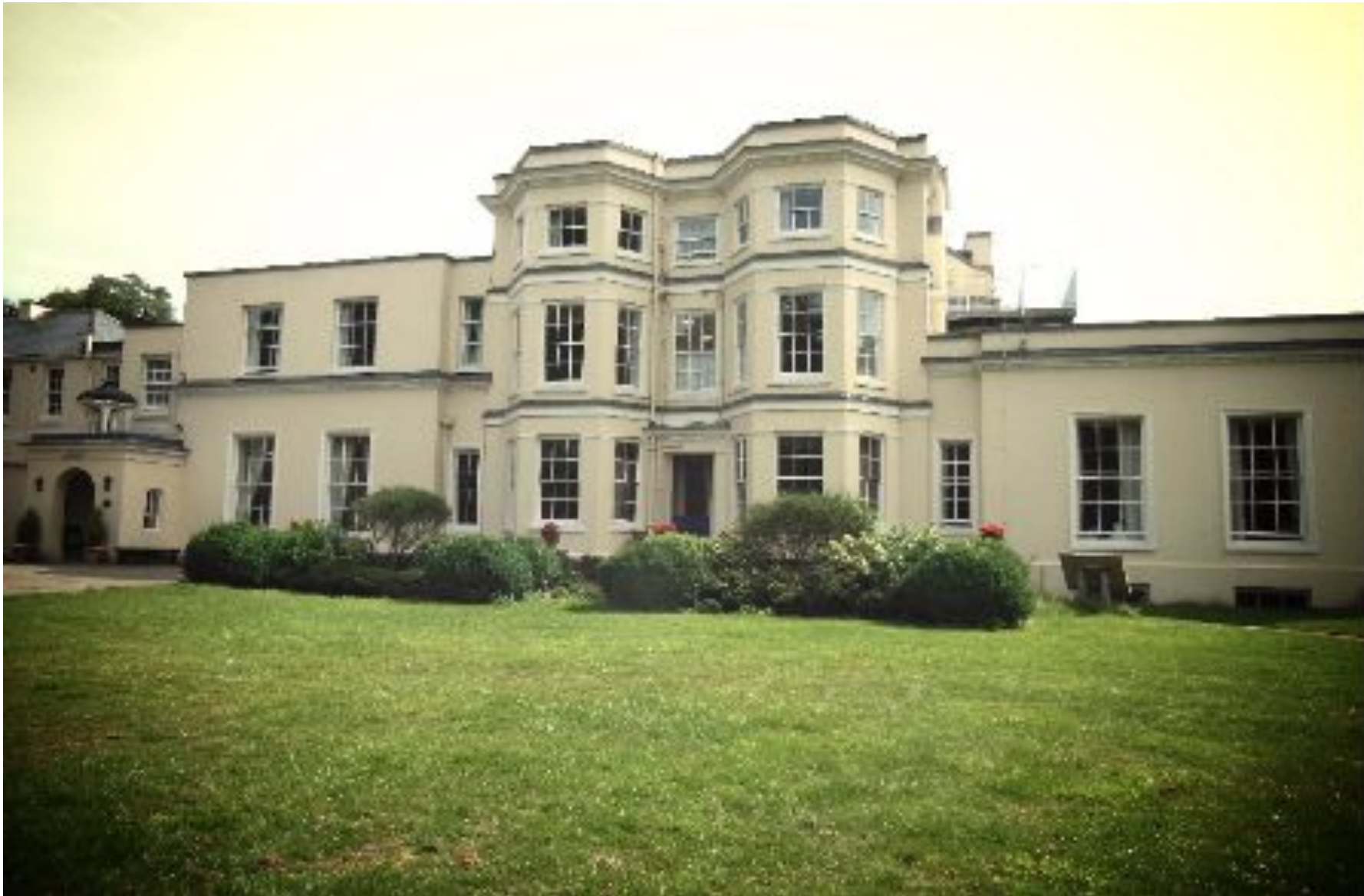
Woodrow High House is a grade II listed manor house buried deep in the Chilterns.