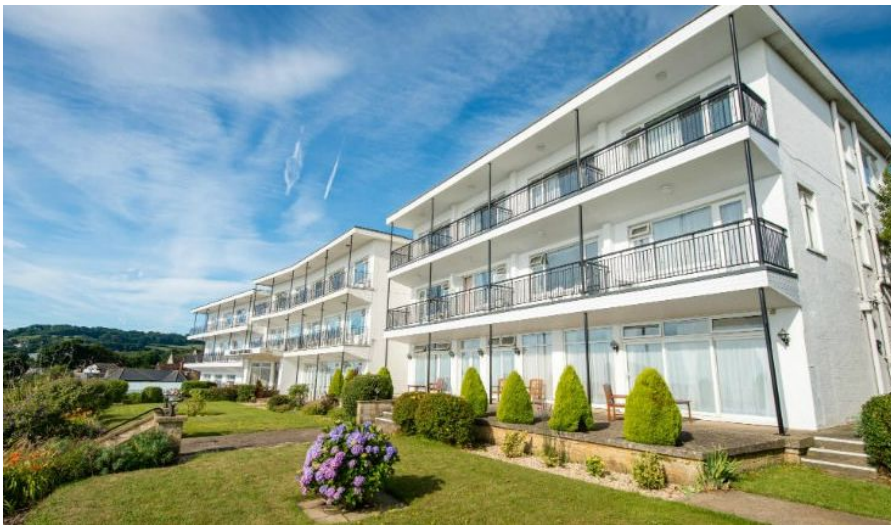
Ocean View Hotel, Shanklin